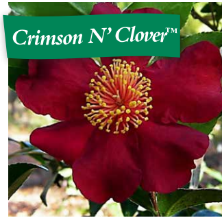
Crimson N' Clover™

Camellia sasanqua 'Green 01-006' PP27597