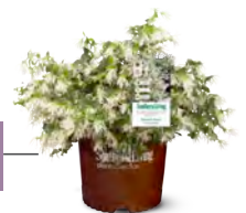
Emerald Snow® Semi-dwarf Loropetalum