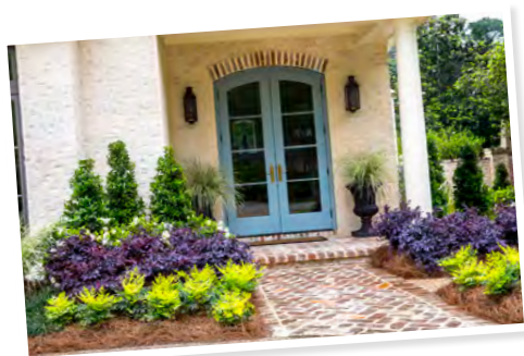
Red Diamond™ Dwarf Loropetalum