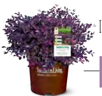
Purple Daydream® Dwarf Loropetalum