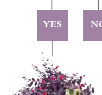
Red Diamond™ Dwarf Loropetalum