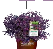
Purple Daydream® Dwarf Loropetalum

I'd like a medium-sized plant for massing