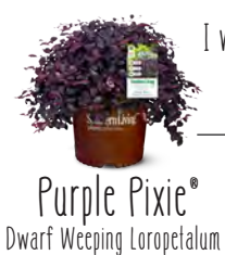
Purple Pixie® Dwarf Weeping Loropetalum