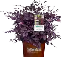
Purple Diamond® Semi-dwarf Loropetalum