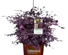
Purple Diamond® Semi-dwarf Loropetalum