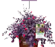
Red Diamond™ Dwarf Loropetalum